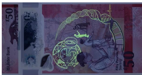
Genuine Ulster Bank (Rear)

Under UV, the front of a genuine Ulster Bank £50 note shows: flora in green, yellow and orange ink ; a pinecone in a green square; a '50' in green ink (in with the flora); and two serial numbers – one in green ink, and one in blue ink.