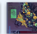
7. UV printing