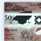
1. Clear window