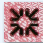
5. Raised print