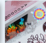
3. Holographic foil