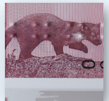
4. Tactile emboss