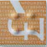
3. Tactile emboss