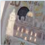
1. Clear window