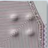
3. Tactile emboss