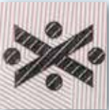
2. Raised print