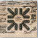
2. Raised print