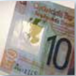
1. Clear window