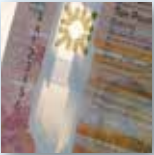
1. Clear window