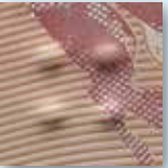
3. Tactile emboss